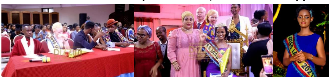
Some photos of Miss IAAD 2021 event

TAS Morogoro thanks all our stakeholders who always support this event to happen in every international albinism awareness day since 2019. Our plan is to do better every year.