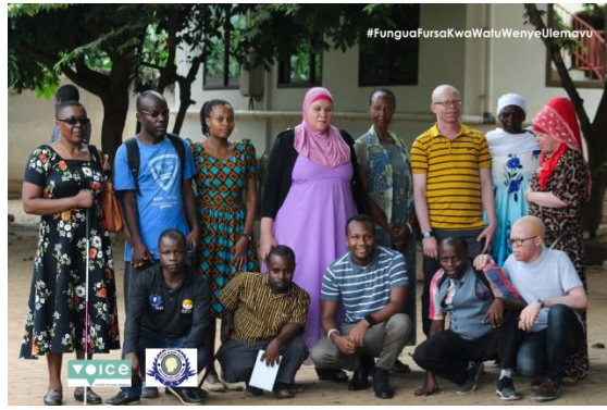
One of participant of DPOs training presenting Participants of DPOs training on group photo His opinion on Opportunities for PWDs created.